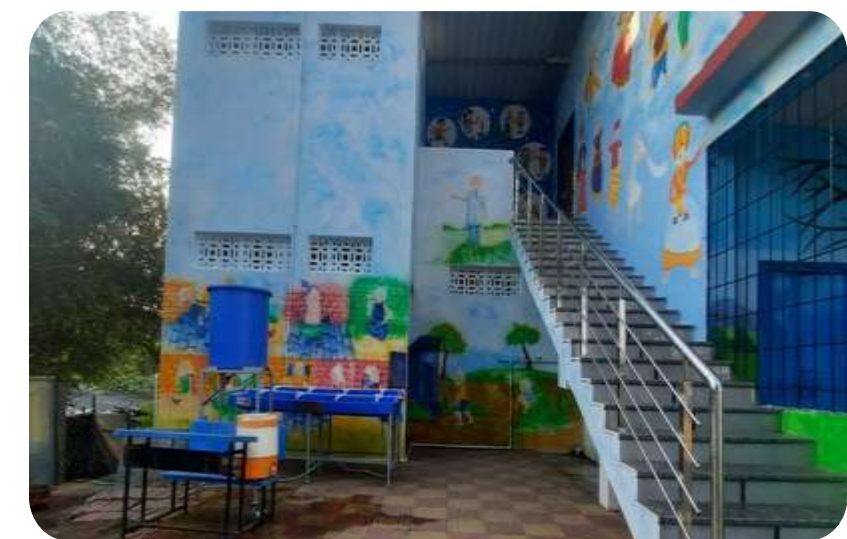
Two storied Toilet