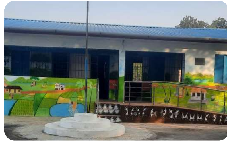
Water Conservation Structures